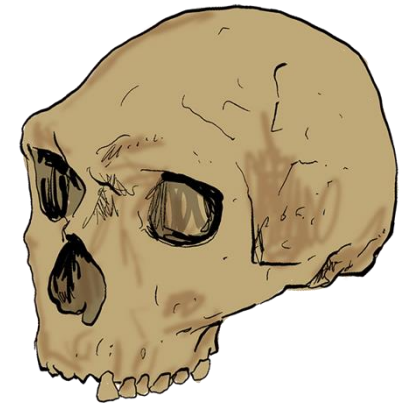
Artist's impression of the early hominid skull discovered in Petralona cave.

Archaeological studies suggest that people have lived in the Hellenic (Greek) region for hundreds of thousands of years. There is evidence of Palaeolithic life found in a cave near Thessaloniki – Petralona. Hundreds of thousands of years later, one of the earliest and most advanced civilisations of the time flourished from 3000 BCE – 1450 BCE , the Minoans on the Greek island of Crete. These fascinating people have been considered essential to the foundation of European civilisations for centuries. Historians believe that the Minoans were the first advanced European civilisation. They built huge buildings , created beautiful paintings (frescoes), crafted impressive tools , invented writing systems and built a vast trade network . The Minoans lived on the isle of Crete . Across this large island, they built magnificent palaces linked to towns and villages across the island by roads. We know about the Minoans because, in the early 1900s, an archaeologist called Sir Arthur Evans discovered the ruins of a large complex on the island of Crete. In c.1450 BCE, the Minoan civilisation came to an end. Archaeologists and historians are unsure about what happened to them, which remains a mystery.