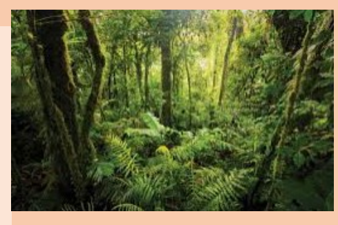
Rainforest —a tall, dense forest that receives lots of rain every year.